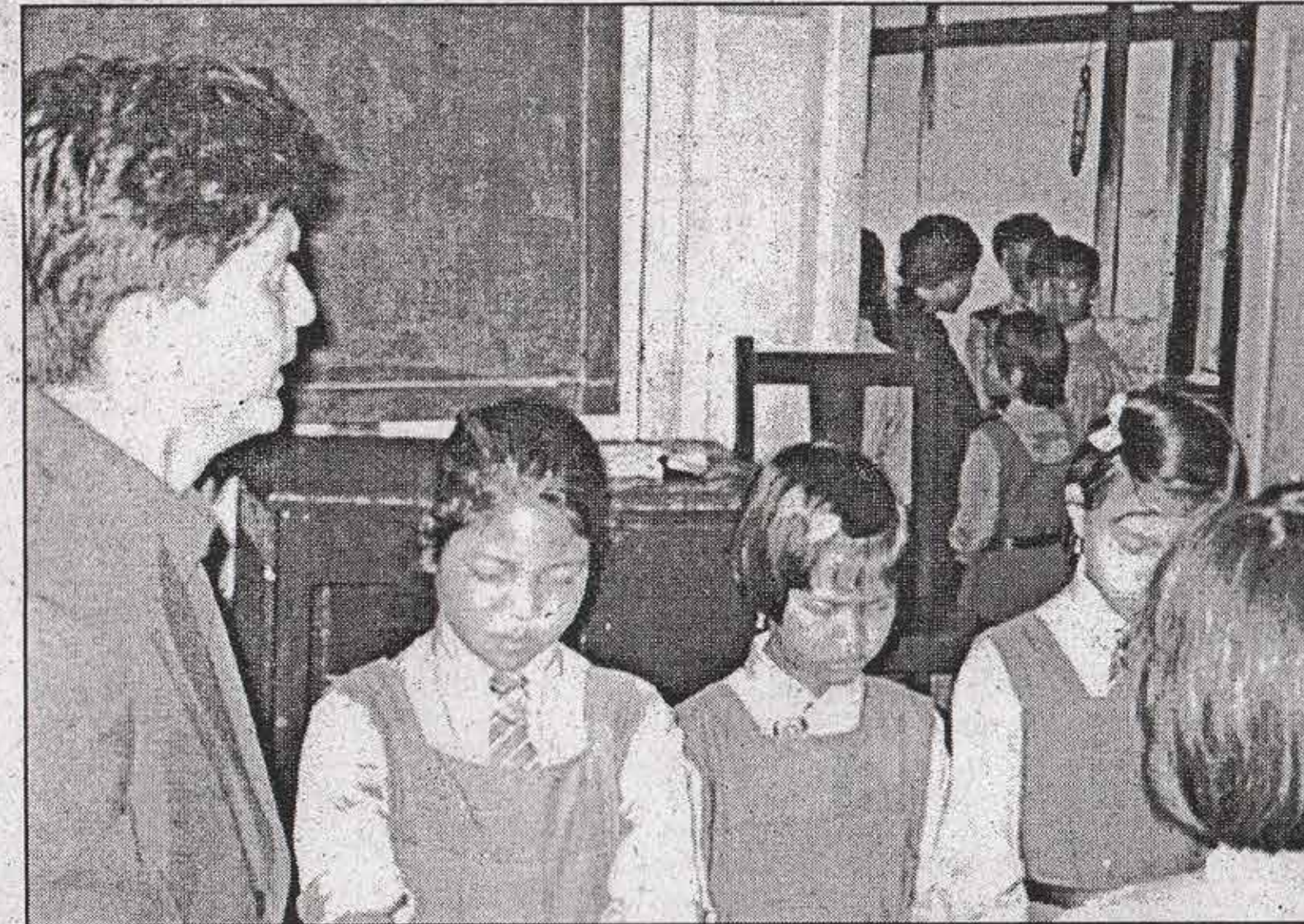
A pastor prays for school students of Khasi Jaintia National Government Upper Primary School, Mawkhair, on Thursday.