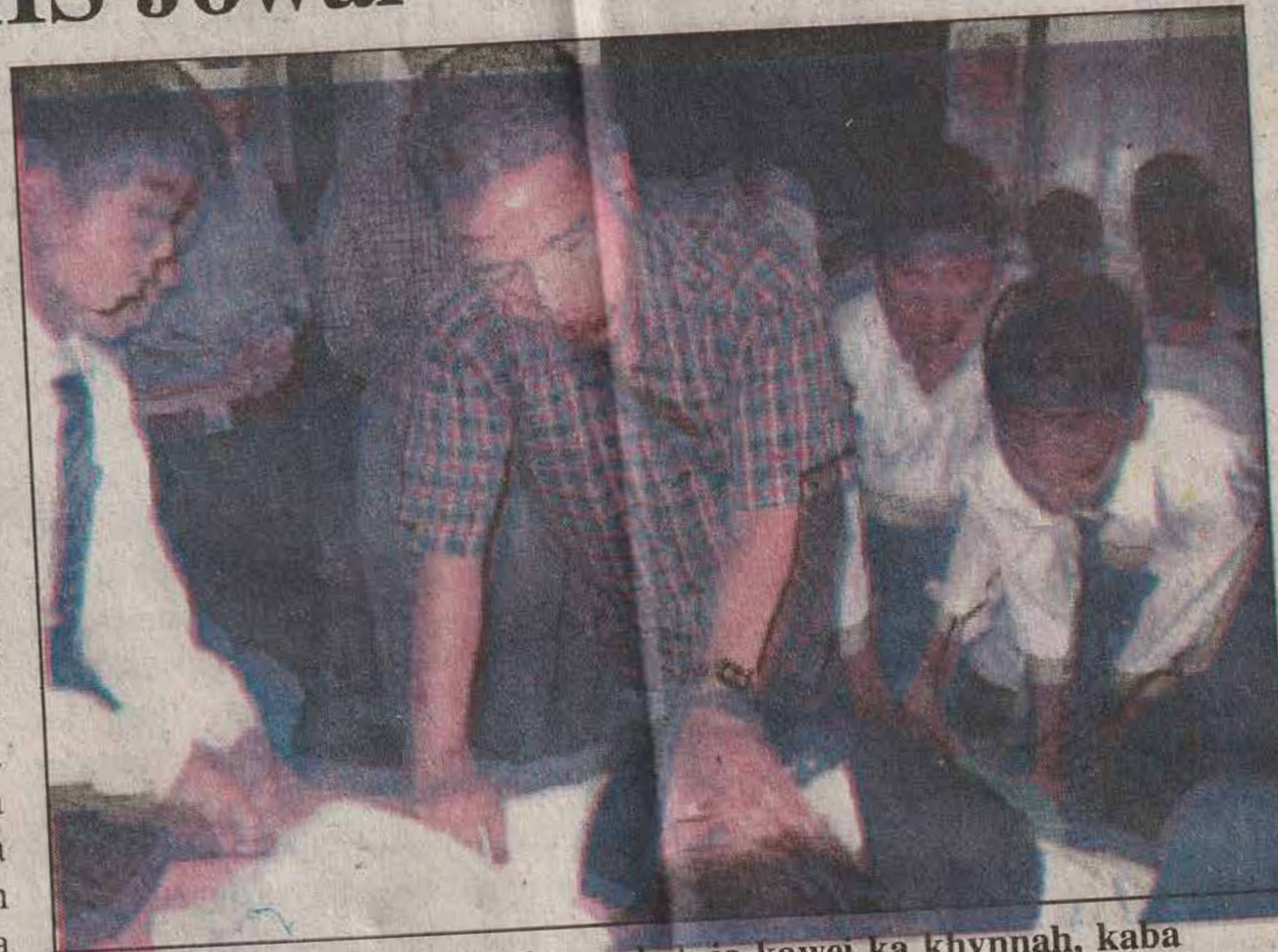
Ki nongduwai, ki dang ialeh pyrshah ia kawei ka khynnah, kaba kyrthat bad lynniar ha skul DNS, Shillong

Ka jingwan hiar ka ribaibal, ha kine ki sngi kiba mynta ha ki khynnah skul ka la pynlong ruh ba wat ki nonghikai ki hap ban beh noh ia ki khynnah skul tang namar ba ki khynnah skul ki la ioh ia kata ka ribaibal, khnang ba kane ka ribaibal kan ym trei borbah. Hynrei katba dang iaid ki sngi ki por ka ribaibal, ka la nangtrei nangtrei sa ha ka Nongbah Jowai haba ka la sar lut la jan man la ki skul kiba don ha kane ka jaka kaba la sdang mynta ka sngi.