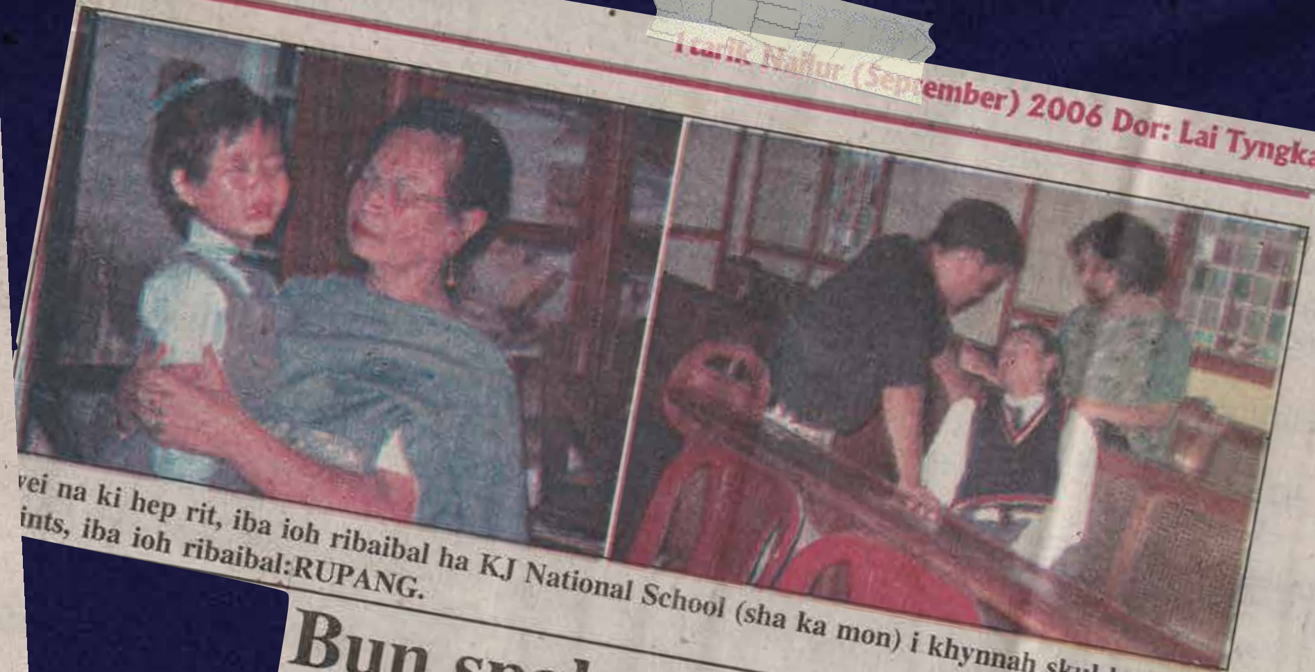
vei na ki hep rit, iba ioh ribaibal ha KJ National School (sha ka mon) i khynnah skul ha All ints, iba ioh ribaibal: RUPANG.

1 st Starik Nailur (September) 2006 Dor: Lai Tyngka