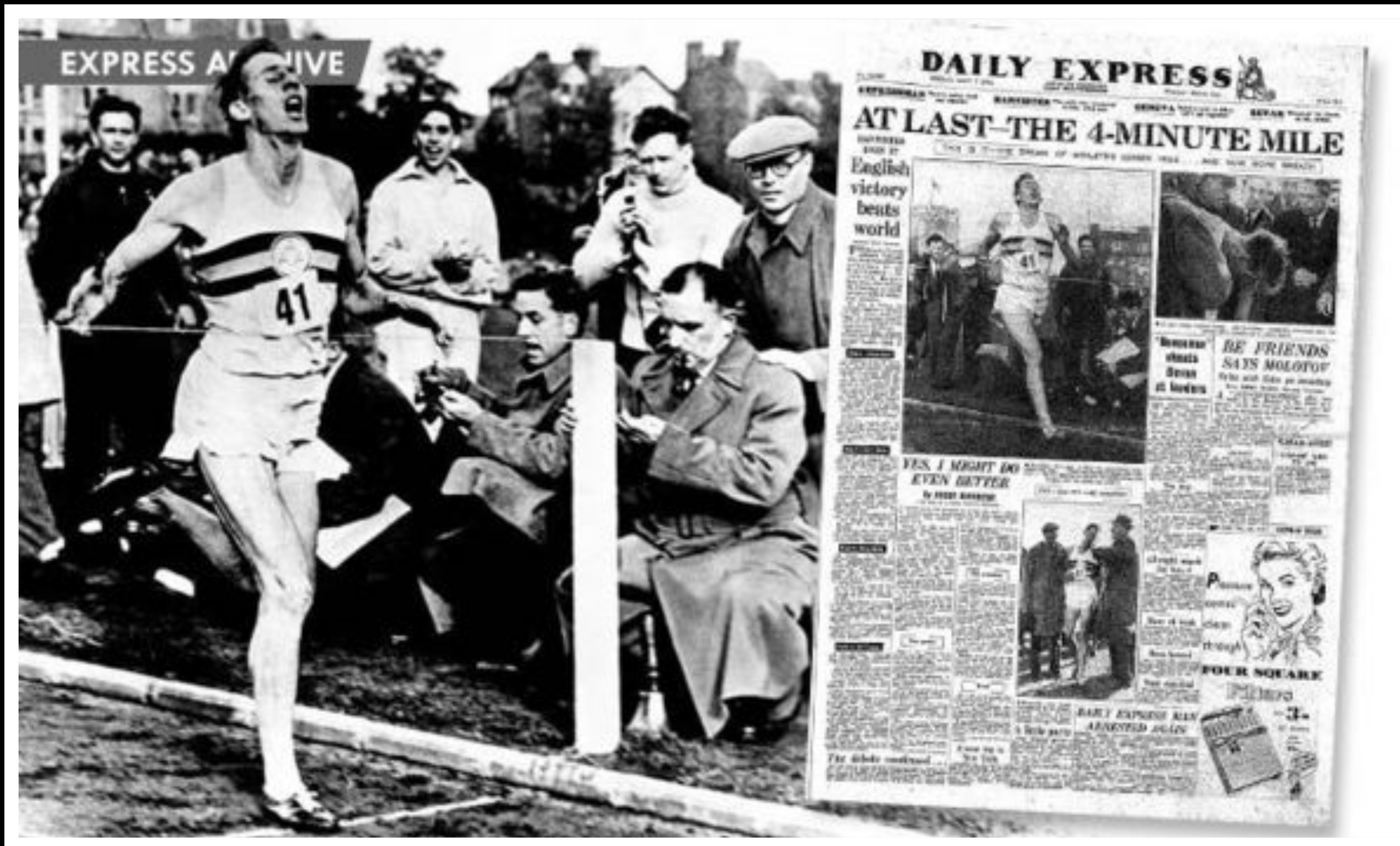
Roger Bannister was the first person to run the sub 4 min mile.