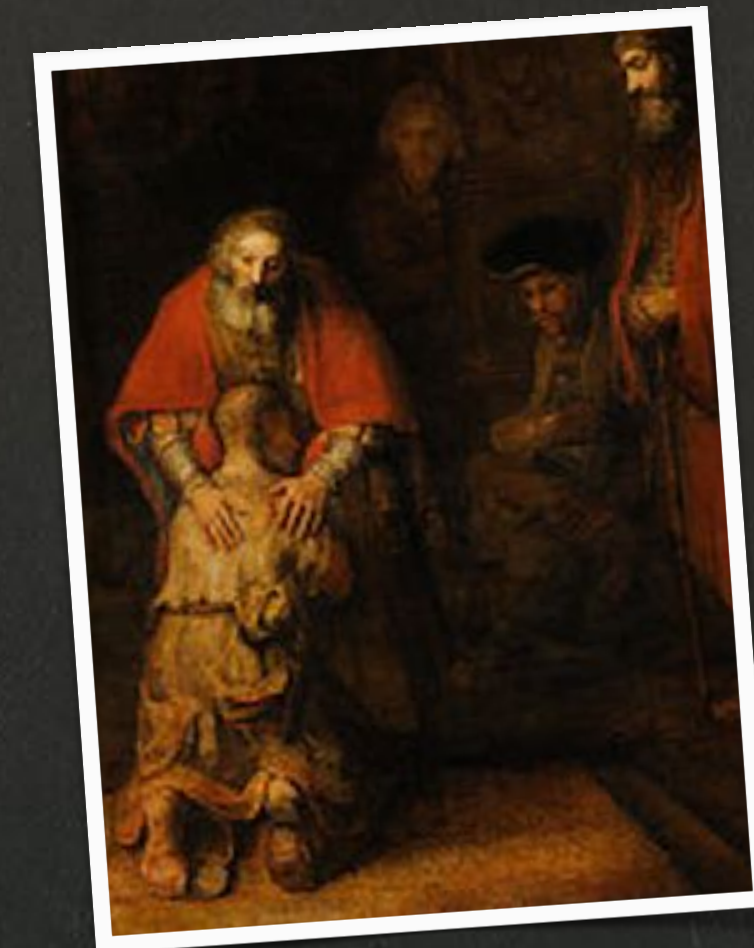
THE LOST SON