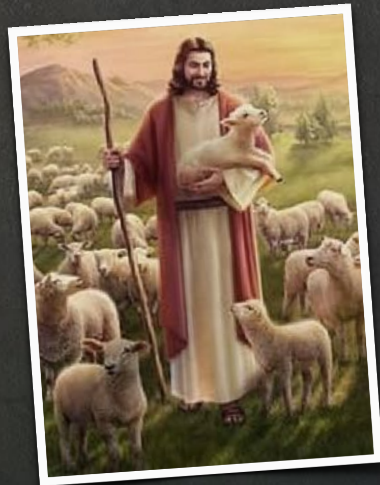
THE LOST SHEEP