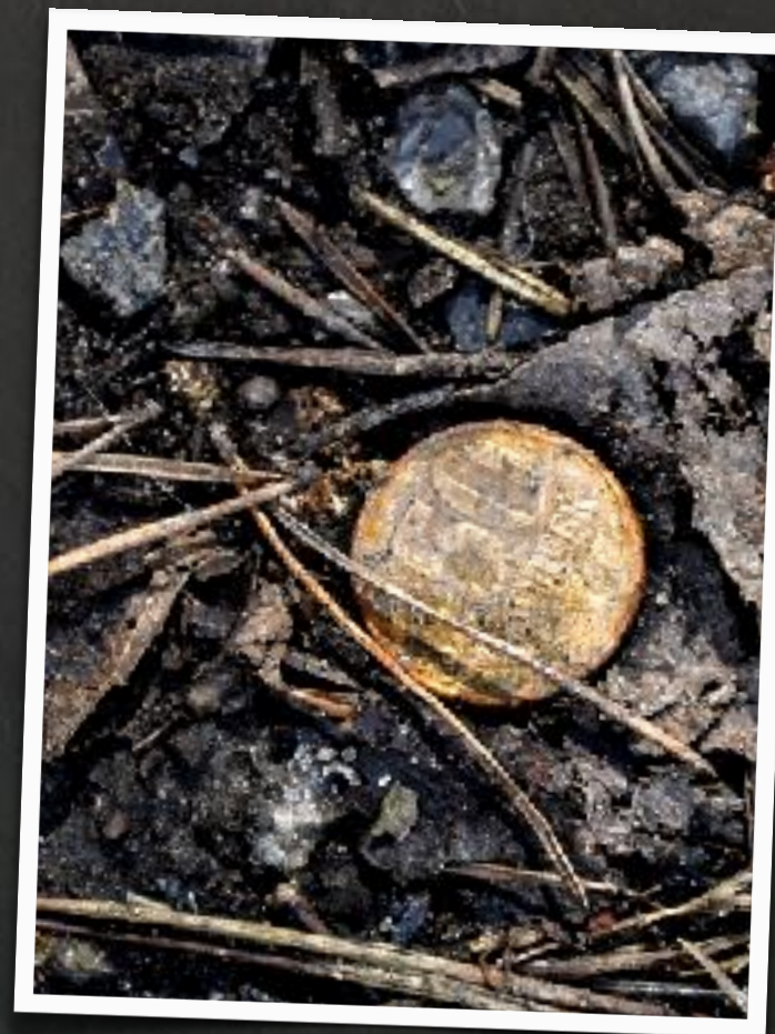
THE LOST COIN