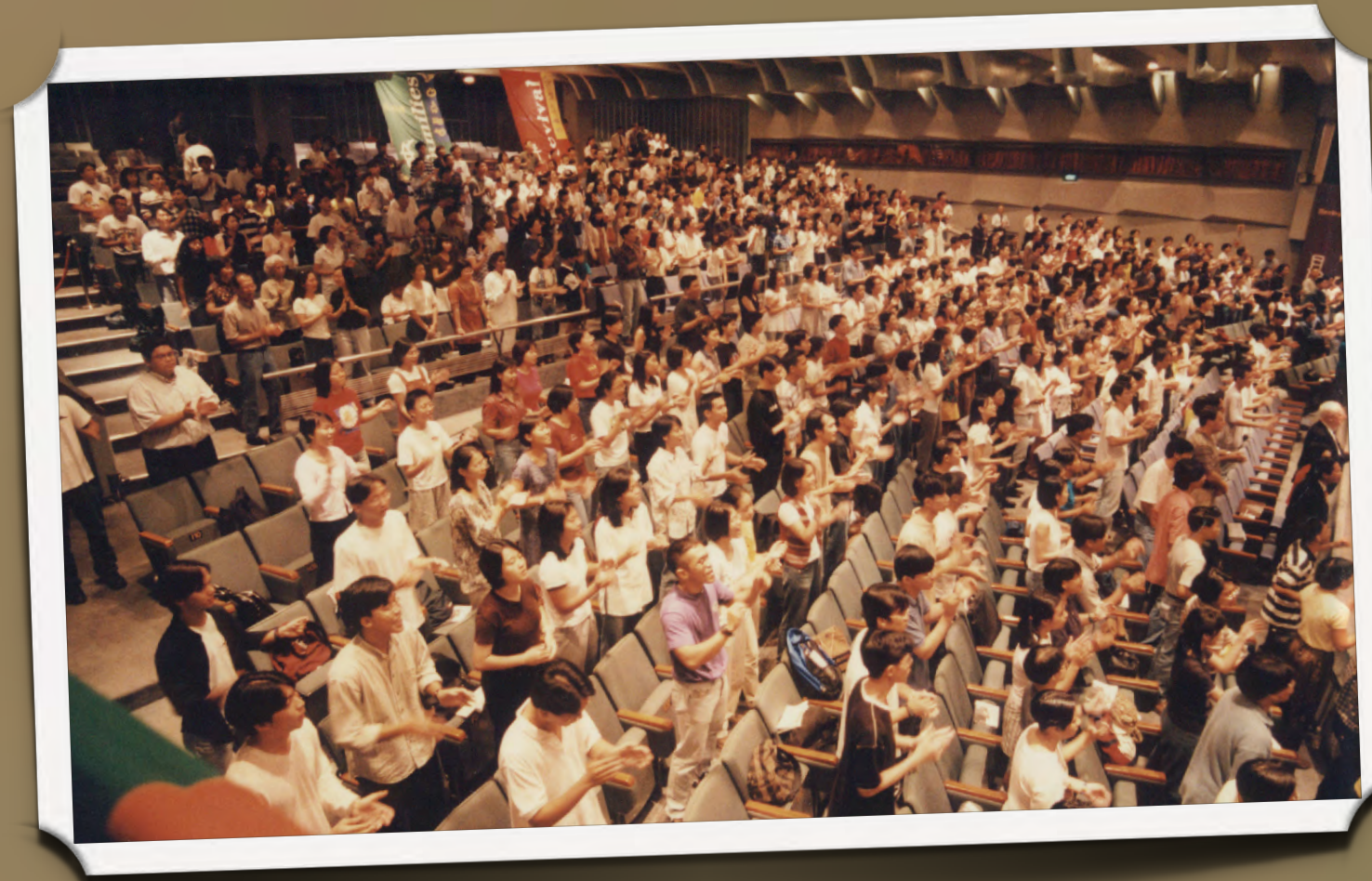
World Trade Centre