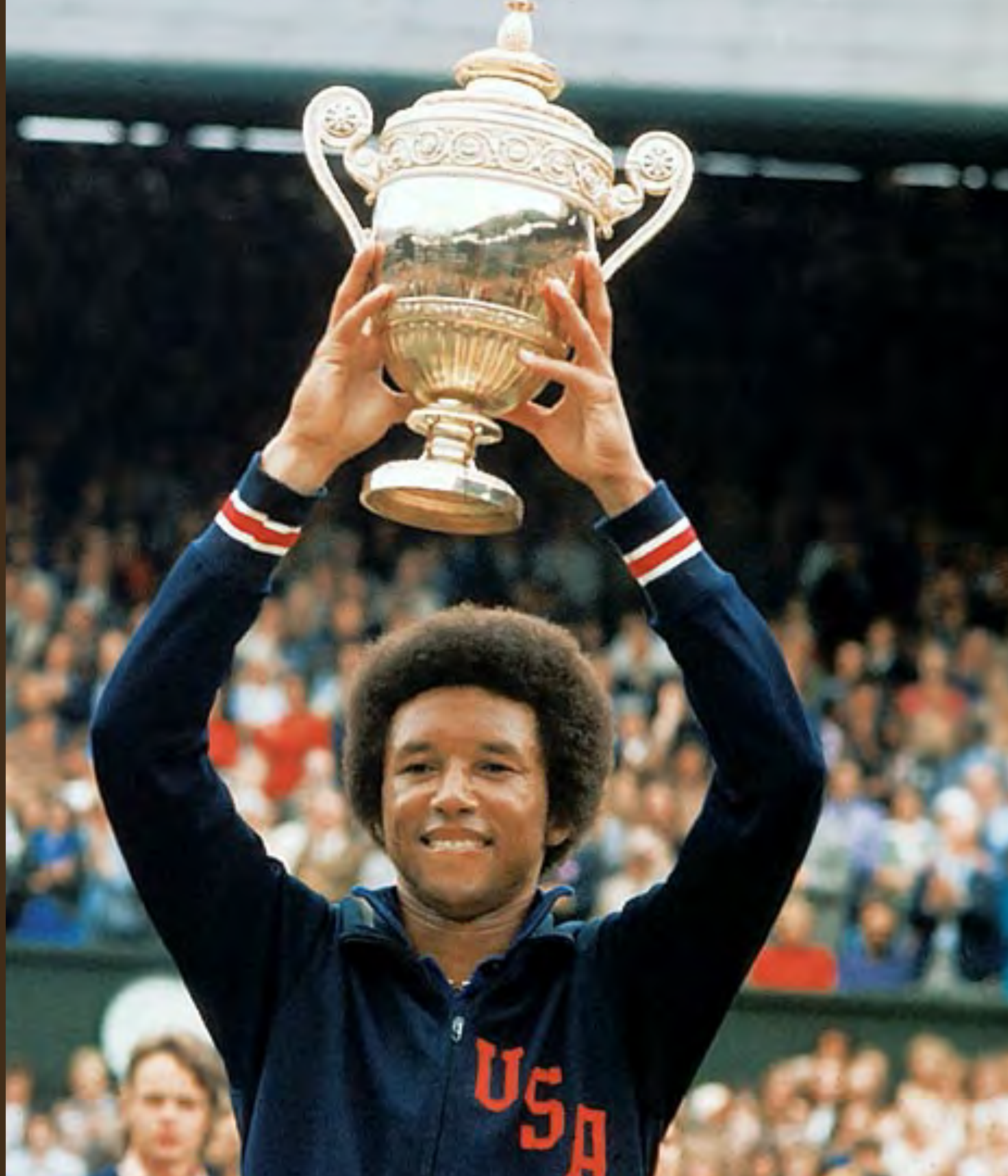
ARTHUR ASHE Wimbledon Champion