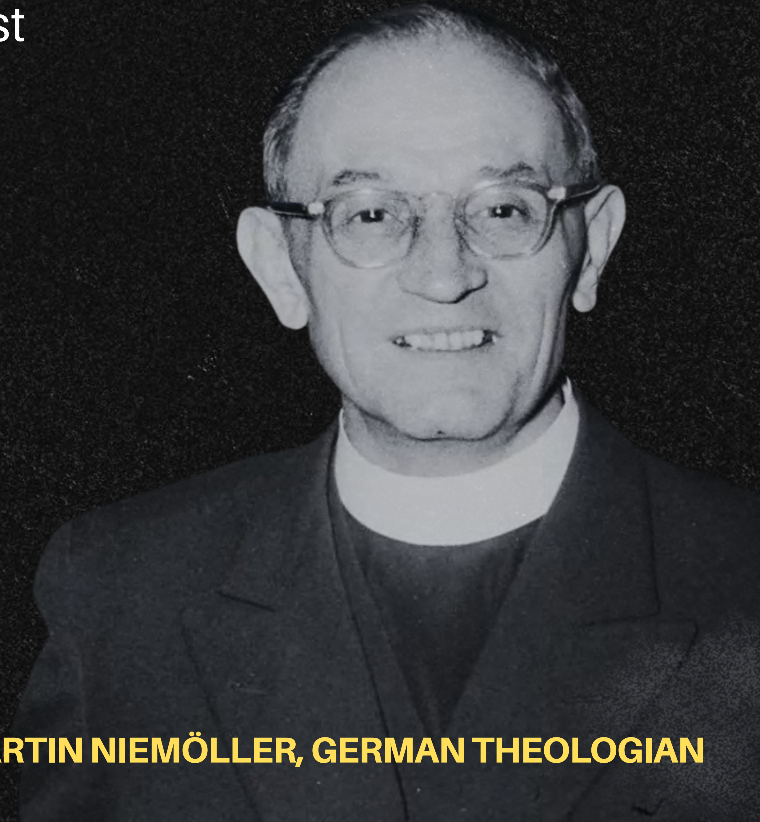
PASTOR MARTIN NIEMÖLLER, GERMAN THEOLOGIAN

Because I was not a trade unionist Then they came for the Jews And I did not speak out Because I was not a Jew Then they came for me And there was no one left To speak out for me